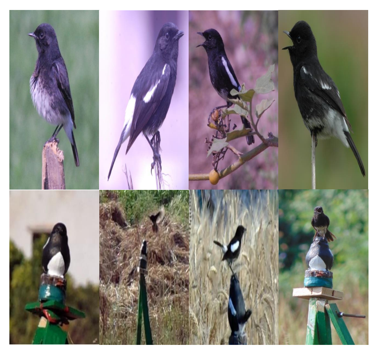
Figure 1. Top row - Morphology of male Pied Bush Chat (while not singing and singing). Bottom row - Model and singing posture of Pied Bush Chats during simulated territorial conflicts.

Under the IUCN red list of threatened species, the Pied Bush Chat ( Saxicola caprata ) falls under the least concern (LC) category, and none of the birds were sacrificed or brought to the laboratory under any circumstances.