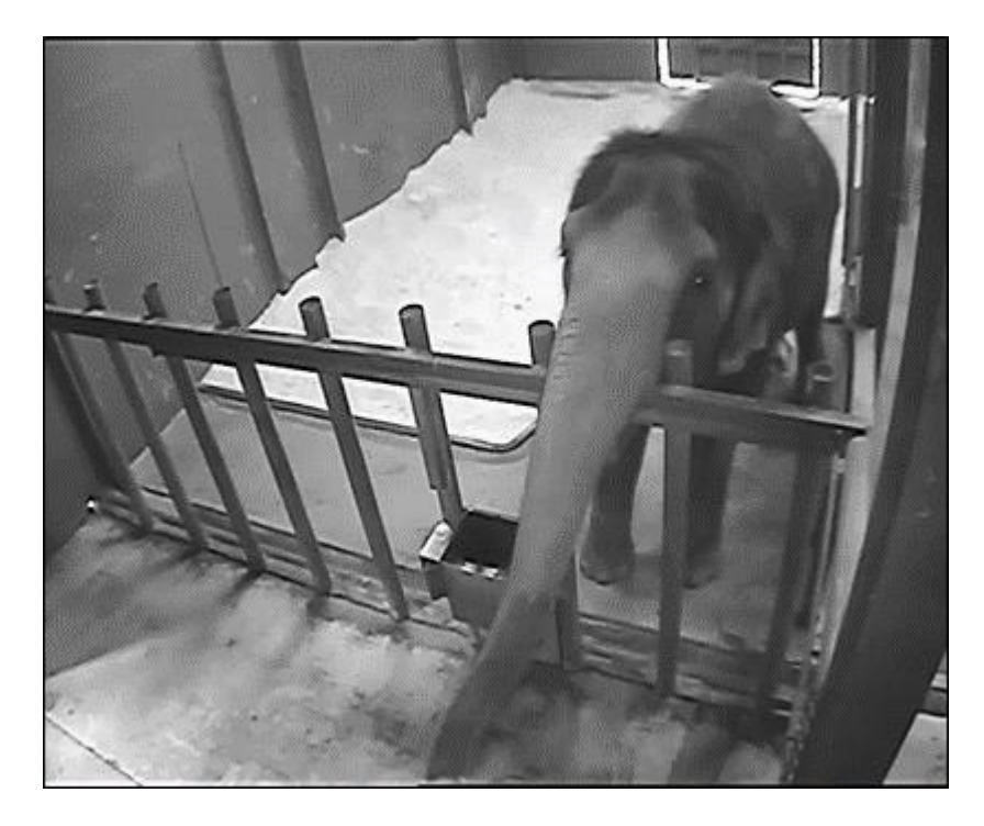
Figure 2 . Photo of Permai trunk reaching towards the stimulus. The trunk tip is within 15 degrees of the stimulus center and greater than 80 cm horizontal distance from the elephant's face. Both trunk reaches above and below the horizontal enclosure bar were included in the total trunk reach duration.

experimental equipment and barn isolation in ten 10-min acclimation sessions. All equipment, including unworn pieces of the shirts, was present during all acclimation trials. The electronic equipment was turned on with no stimuli playing from the speakers. A plain grey background was played on both TVs during the acclimation sessions. All equipment present in the acclimation trials was also present in the experimental trials.