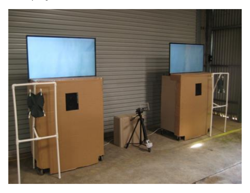
Figure 1. Experimental equipment in the location used for acclimation and unimodal trials at Perth Zoo. All equipment is beyond the maximum reach of the elephants' trunks (2.7 m from the enclosure).

Playback equipment . Two catering trolleys (90 cm wide x 113 cm high x 50 cm deep) covered in blank cardboard were used to display the visual and auditory equipment. An M-Audio (BX5 D2) speaker was placed in the horizontal center of each trolley at a height of 81 cm from the ground to play back the auditory stimuli. The speakers were connected to a Mac Mini computer (Apple, Inc.) through a Behringer F Control audio interface (FCA202). Video stimuli were played through two 42" LG (42LM6410) LCD screens covered with 3 mm Perspex. One TV was placed on top of each trolley with the top of the TVs 1.77 m from the ground. The inside edge of each trolley was located 750 mm from the center of the testing area, with one olfactory stand made of unused 10 mm PVC reticulation piping and fishing line situated on the outside edge of each trolley (Figure 1). The elephants' responses were recorded by a Sony Handycam (HDR-PJ200E) on a 70 cm tripod situated on the midline between the two trolleys and a Ness Day/Night Exview IR camera attached to the roof of the barn.