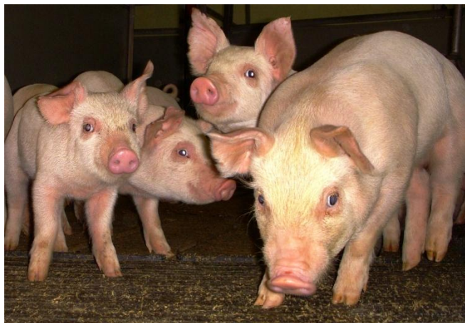
Figure 5. Group housing of weaned piglets allows for the practice of important social skills.