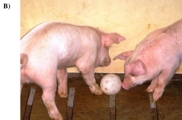
Figure 2A,B. Object play in pigs.