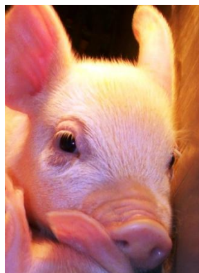
Figure 1. Piglets engage in play behavior starting around 3 to 5 days old.

the development of healthy limbs in swine. By providing adequate pen space, pork producers can increase the occurrence of locomotor play, which may indirectly prevent future health issues.