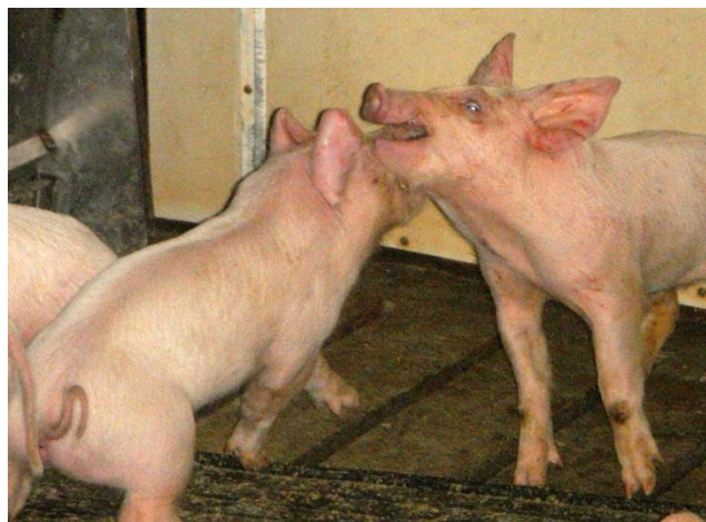
Figure 4. Rough-and-tumble play in weaned piglets.

Weaning piglets from their sow is one of the most significant practices in modern pig production. In most commercial farms, piglets are weaned anywhere between 20 and 35 days old, while free-ranging sows wean their piglets around 60 to 137 days old (Jensen & Recen, 1989; Newberry & Wood-Gush, 1985). This process can be highly stressful due to unfamiliar transport, shifting of diet to solids, pathogens of a new environment, and an increase in aggression as the dominance hierarchy of unfamiliar